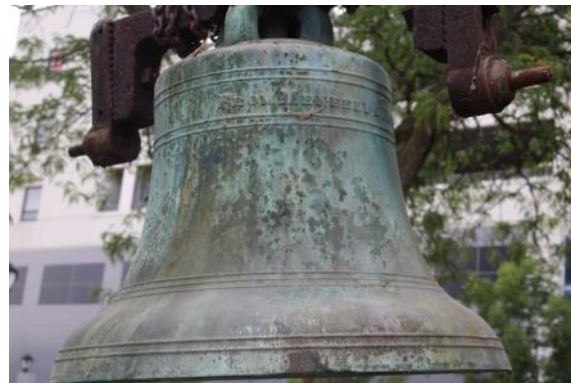
Close pictures of the Bell with the date and foundry markings