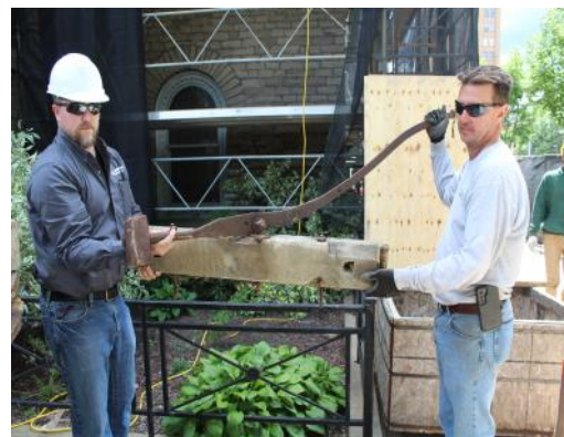
Removing the frame work that held the bell.