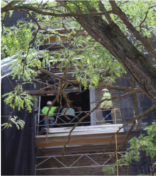
Bell removed from the tower

As part of the bell tower restoration on August 20th, the bell in the bell tower was removed. The bell will make a trip to Ohio where it will be refurbished. The bell will return to First Pres and be reinstalled in the bell tower so once again the bell of First Pres will call members and friends to worship service as it has for over two centuries.