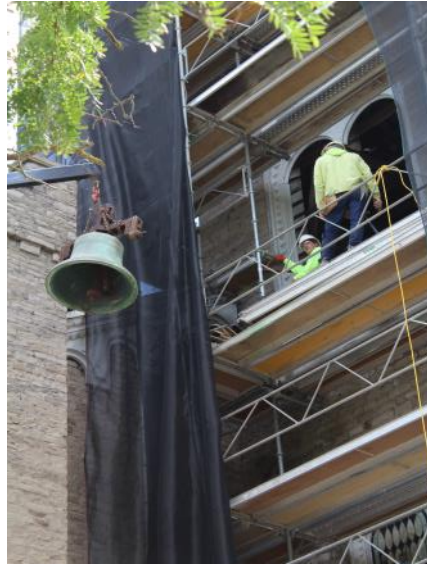
Bell free of the tower