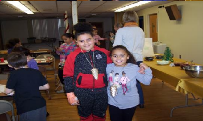
Golden Pine Cone Recipients