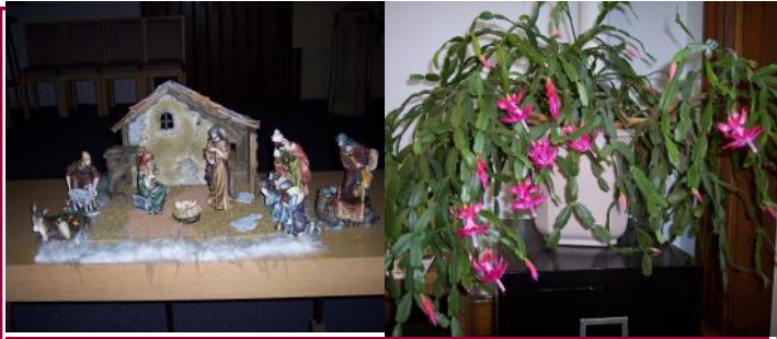
The Nativity and Christmas Cactus in the office