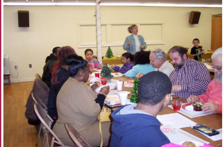
Christmas Potluck 2019