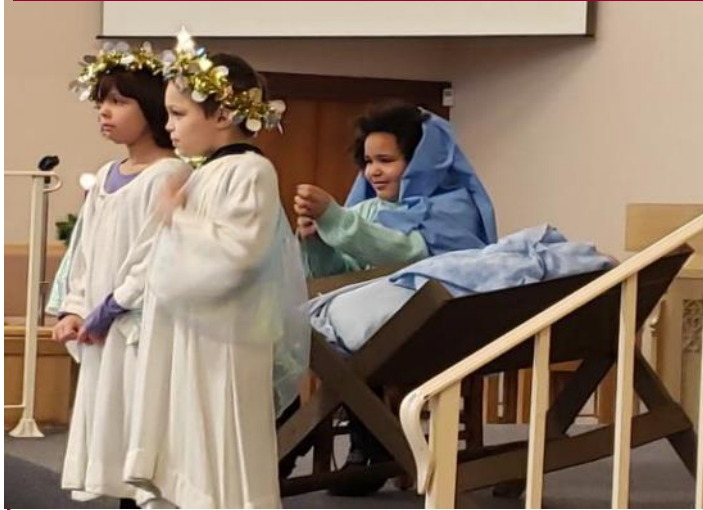
A Sunday School Christmas